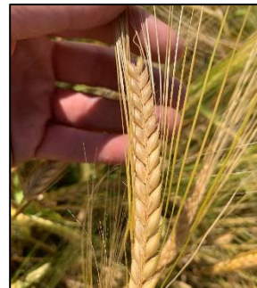
HudsonNY barley at Chatham