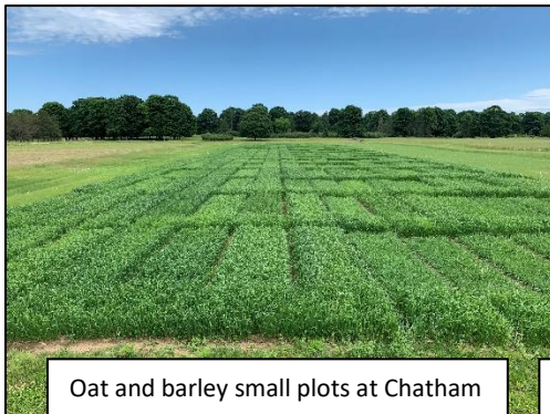
Oat and barley small plots at Chatham