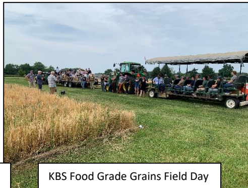
KBS Food Grade Grains Field Day