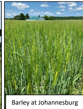
Barley at Johannesburg